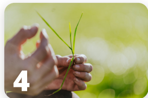
4 Green shoots

We will be running five workshops across the region in March 2024 to share, test and refine these scenarios with farmers and growers throughout the region.