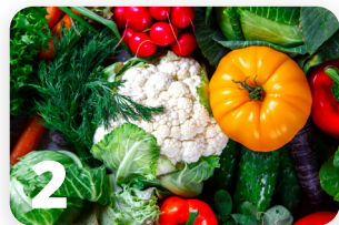
2 The world's food basket of choice